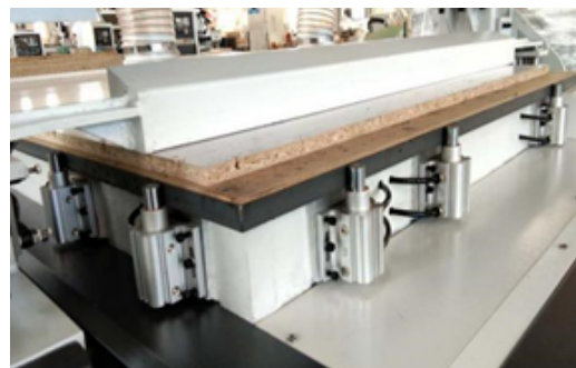
Positioning pop up pins